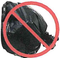
Trash or Yard Trim Place this with your weekly refuse pickup.