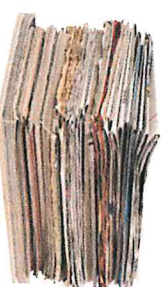
Paper, Newspaper, Magazines & Books