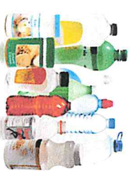
Plastic Bottles, Jars & Jugs