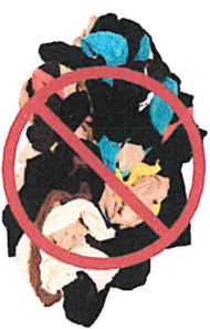
No Textiles: Please donate clothing, shoes, towels, or rugs