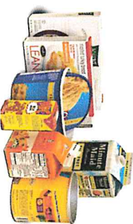
Cardboard Boxes & Cartons Flatten Boxes