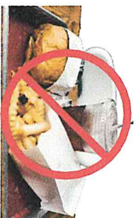
No Food or Food Stained Paper Place this with your weekly refuse pickup.