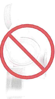
No Styrofoam Place this with your weekly refuse pickup.