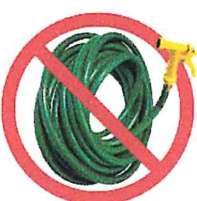
No Tangles: Hoses, wires, chains &/or cords. Place this with your weekly refuse pickup.